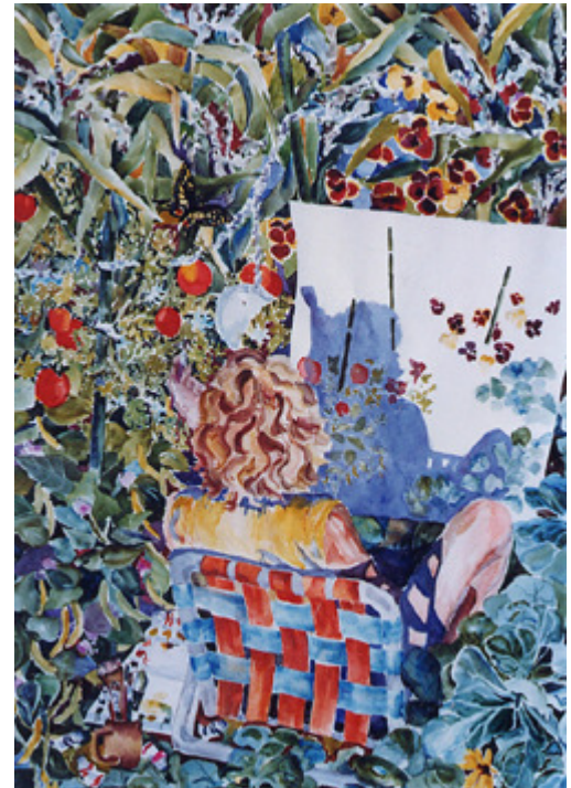
The Artist in the Garden State